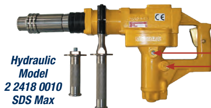
Hydraulic Model 2 2418 0010 SDS Max

Second handle position SAE #8 port for hydraulic hose connection