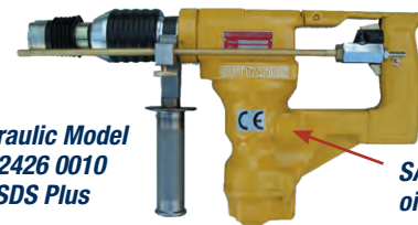
Hydraulic Model 2 2426 0010 SDS Plus

Drill concrete anchor holes, thru holes, piping and mechanical openings for construction and repair work. Switches to rotary drilling mode for steel and wood.