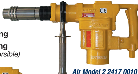
Air Model 2 2417 0010 SDS Max

Rotation Only For drilling steel and wood (not reversible)